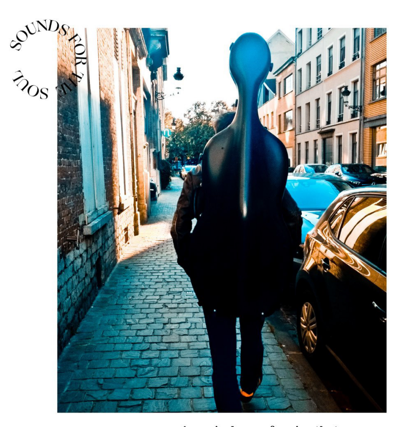
A musical way of saying that we care.

Sounds For The Soul continues to bring hope, providing personal, one-on-one classical music experiences that allow individuals to reflect on their challenges from a new perspective.